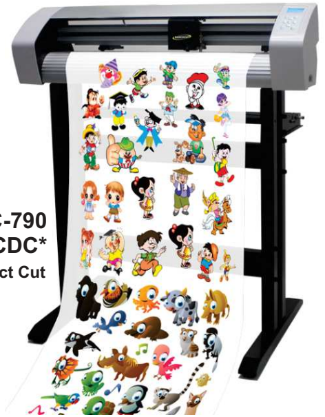
PL-VC-790 PL-VC-790 CDC*