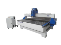
PLE-2M3M CNC ROUTER CUTTER & ENGRAVER