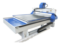
PLE-1325 CNC ROUTER CUTTER & ENGRAVER