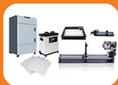
FUME EXTRACTORS AND ROTARY ATTACHMENTS