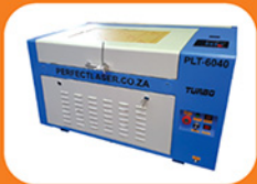
CO 2 LASER CUTTERS AND ENGRAVERS