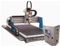
PLE-960 DT CNC ROUTER CUTTER & ENGRAVER