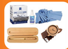
CONSUMABLES AND SUBSTRATES