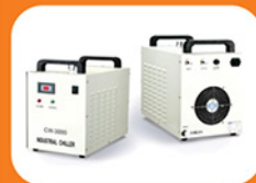
COOLERS, CHILLERS AND PUMPS