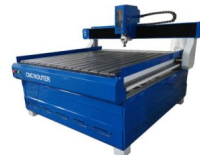
PLE-1212 CNC ROUTER CUTTER & ENGRAVER