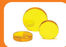
MIRRORS, LENSES AND HONEYCOMBS