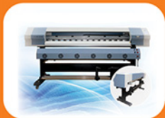
ECO SOLVENT PRINTERS