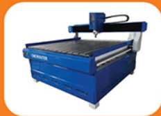
CNC ROUTERS AND ACCESSORIES