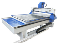
PLE-1325 CNC ROUTER CUTTER & ENGRAVER