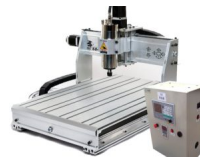
PLE-6040-DT CNC ROUTER CUTTER & ENGRAVER